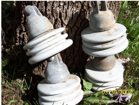
COPCO Power Insulators

20?? Ricky Downes found two power insulators along the buried power line over Grave Creek Hills near Mt. Sexton.