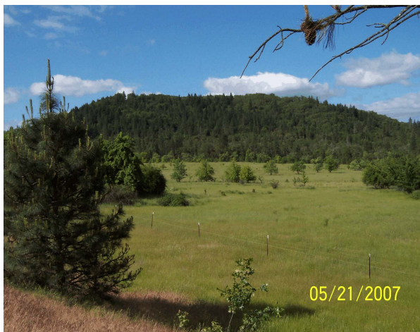
Cochrane Wetlands of Military Warrant: 2007

Natural Prairie & Pasture 6-7 The military patent number 41877 included most of the open wetlands of what would later become part of the 240-acre J. C. Cochrane ranch. The warrant and the ranch's location had a reason: natural sub-irrigation for pasture during the winter, spring, and early summer.