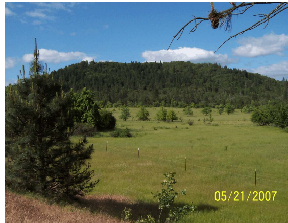
Cochrane Wetlands of Military Warrant: 2007

Natural Prairie & Pasture 6-7 The military patent included most of the open wetlands of what would later become part of the 240-acre J. C. Cochrane ranch. The warrant and the ranch’s location had a reason: natural sub-irrigation for pasture during the winter, spring, and early summer.