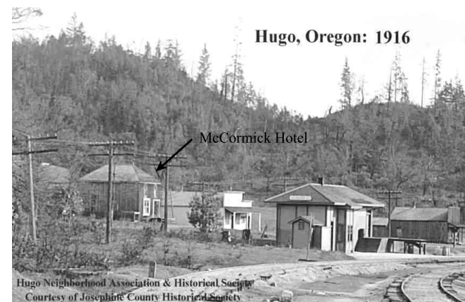
Hugo, Oregon: 1916