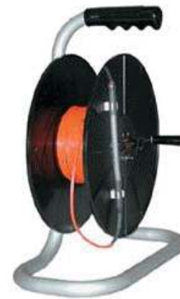
Water Level Indicator

“The function of the Sanitary Well Seal is to protect the water in the well by sealing off above ground access to the well from people, animals, ground water, fertilizers, bird poop and what ever else might want to get in there.”