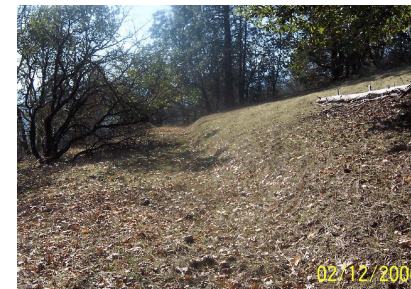
Hugo's High Road

Want more information? Contact an officer of the Hugo Neighborhood on how you can become involved in your community's history and land use.