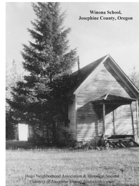
Winona School, Josephine County, Oregon

Hugo Neighborhood Association & Historical Society