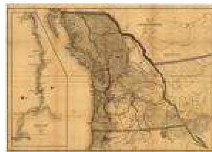
1841 Exploratory Expedition Map Of Oregon Territory

Page 120 2 . “On the 22d, they began their route across the Umpqua Mountains. The ascent was at first