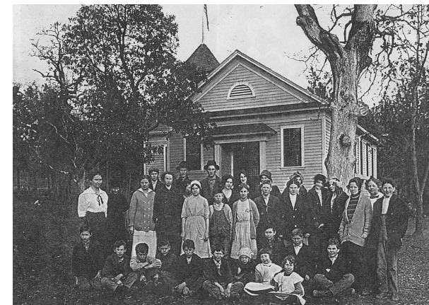
One Room Hugo School. Hugo, Oregon: 1913