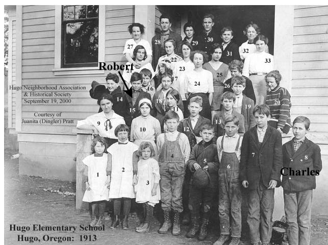
Grades 1 - 8, Hugo Elementary School Hugo, Oregon: 1913