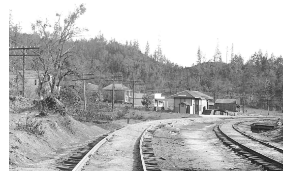
Downtown Hugo Mile Post 487.4: 1916