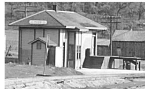
Hugo Depot at MP 487.4: 1916