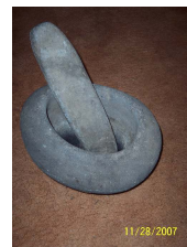
M & Pestle

Trail Rock There is a vertical standing oblong shaped rock about 25' southwest of Chain Tree that is 12' east from Maple Creek at the toe of the side hill castings from building I-5. 8 It has a shape ranging in width from 4' - 5' which is 5' tall out-of-the-ground on its downhill side. It has a flat 3.5' diameter top. This description fits Sapir. 2-3