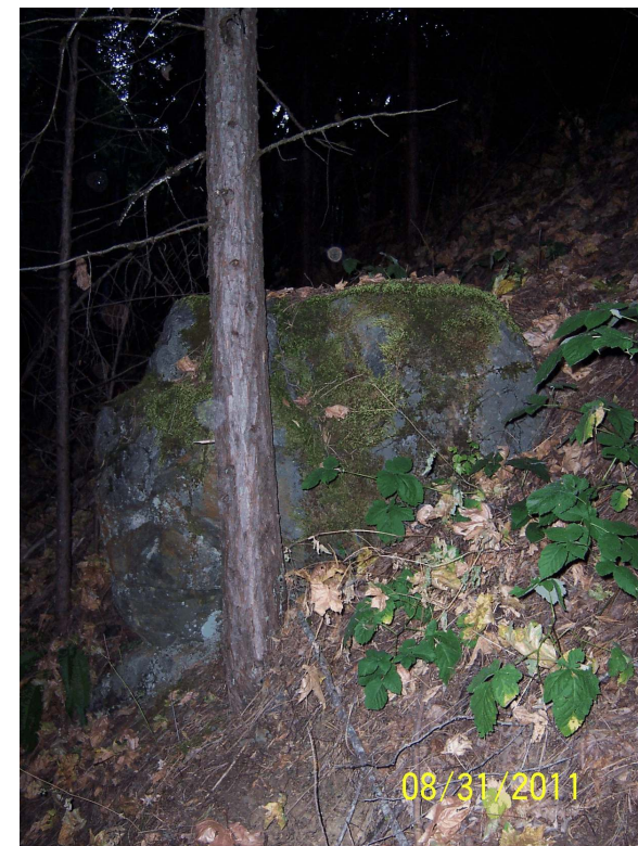
South Face of Sexton Mt. Pass Trail Rock